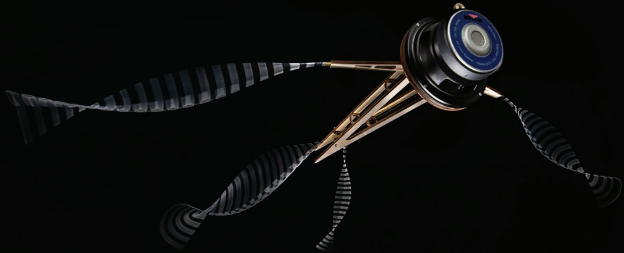
Untitled Tony Nicholls 2021 Mixed media