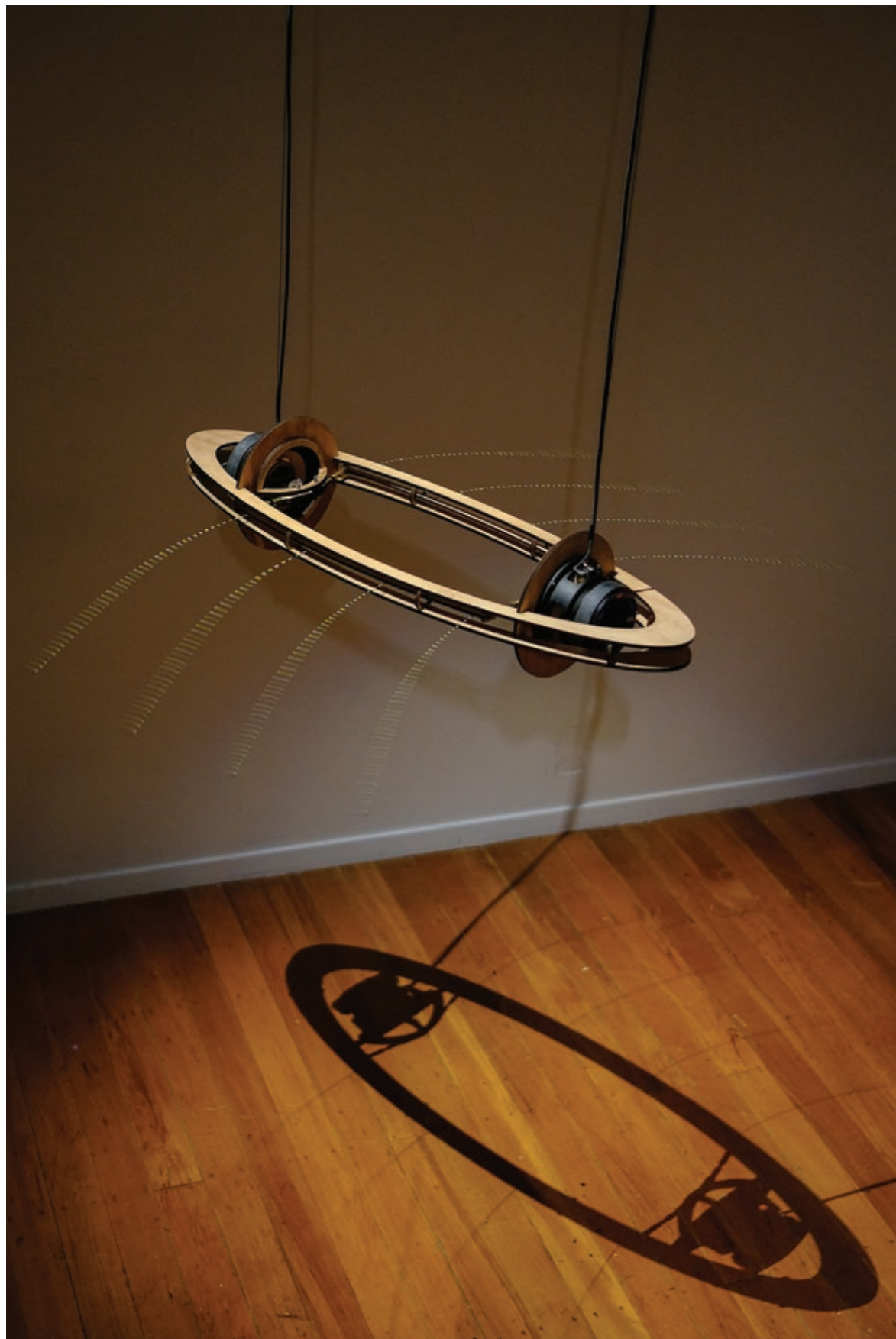
Untitled Tony Nicholls 2021 Mixed media